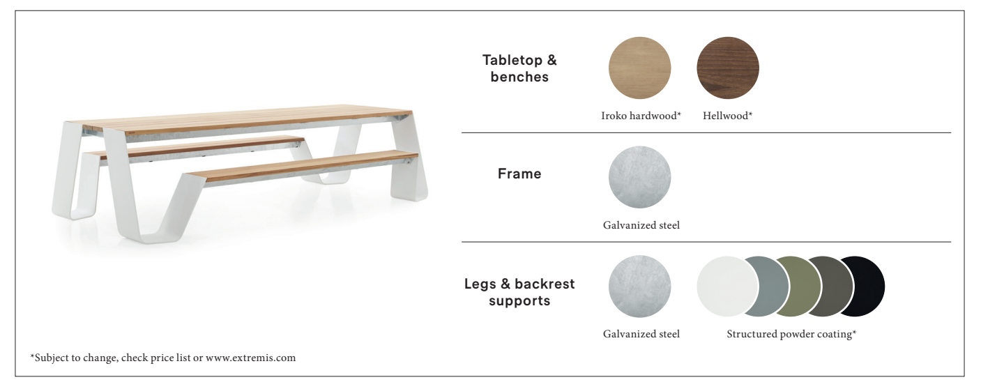
Materials & colors