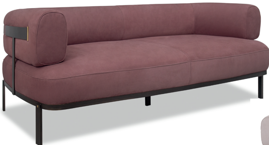
235 x 91 | Kashmir Vin | s. Polish Grape