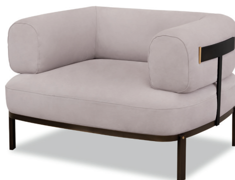
Kashmir Lilas | s. Heritage Lilla

Struttura in metallo verniciato bronzo patinato. Struttura seduta e schienale in multistrato di betulla. Imbottitura in poliuretano espanso a densità differenziata con rivestimento in fibra acrilica. Cintura posteriore con parte centrale rivestita in pelle e fermi terminali in ottone satinato. Cuscineria di seduta e schienale disponibili solo in pelli morbide. ⚡ Cintura posteriore disponibile in tutte le pelli previste dal catalogo.