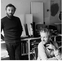
Ronan & Erwan Bouroullec

Ronan Bouroullec (born 1971) and Erwan Bouroullec (born 1976) have been working together for about twenty years now. Their collaboration is a permanent dialogue nourished by their distinct personalities and a shared notion of diligence with the intention to reach more balance and fineness. Their work has covered many fields ranging from the design of small objects as jewellery to spatial arrangements and architecture, from craftsmanship to industrial scale, from drawings to videos and photography. They have collaborated with leading design companies such as Vitra, Cassina, Artek, Danskina, Magis, Alessi, Galerie kreoo, Established & Sons, Axor Hansgrohe, Flos, Kvadrat, Glas Italia, Kartell, Kettal, Iittala, Cappellini, Ligne Roset, Nani Marquina, Mattiazzi, Mutina, Samsung and Hay. Designs of Ronan & Erwan Bouroullec are part of select international museums' permanent collections and several exhibitions have been devoted to their work including the Design Museum, London, the Museum of Contemporary Art, Los Angeles, the Centre Pompidou Metz, the Museum of Contemporary Art, Chicago, the Musée des Arts Décoratifs in Paris, the Vitra Design Museum or the FRAC Bretagne. The Bouroullec studio is located in Paris, and the whole team numbers around eight people. To discover more about Ronan & Erwan Bouroullec's work, please visit www.bouroullec.com