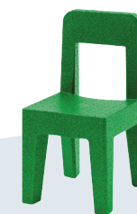
Matt colour Green 1638 C