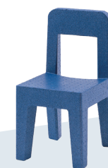
Matt colour Blue 1606 C