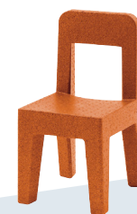
Matt colour Orange 1082 C