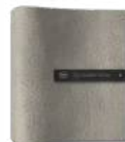
Old Shabby Pietra