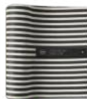
Texture Day Thick Line