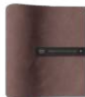
Nabuck Vintage Rose