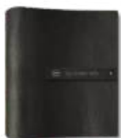
Old Shabby Nero