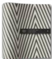
Texture Day Chevron