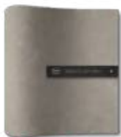
Nabuck Light Grey