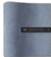
Nabuck Light Blue