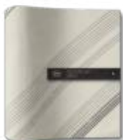
Texture Day Wave