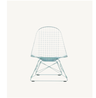
Wire Chair LKR