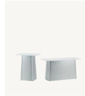
Metal Side Tables