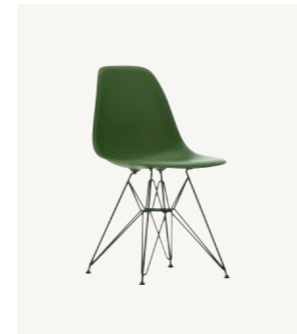
Eames Plastic Chair DSR