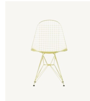
Wire Chair DKR