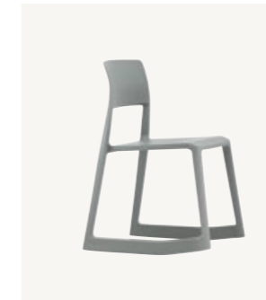
Tip Ton RE / Tip Ton