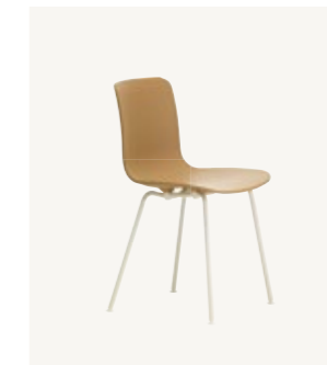
HAL RE Tube