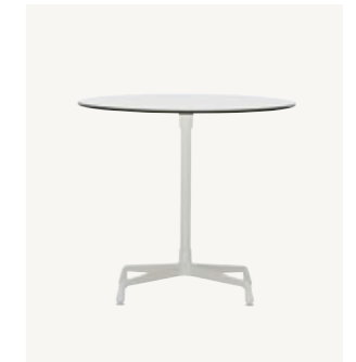
Eames Contract Table