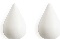
Dropit Large White