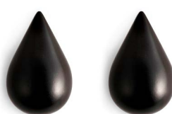
Dropit Large Black