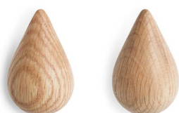
Dropit Large Oak