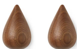
Dropit Large Walnut