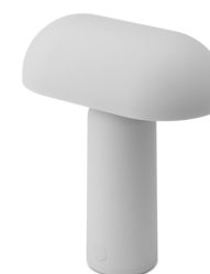
Porta Table Lamp Grey H 23,5 x W 20,2 x D 11,2 x Ø 6,5 cm