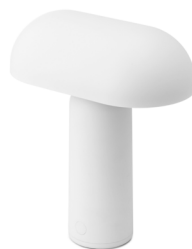
Porta Table Lamp White H 23,5 x W 20,2 x D 11,2 x Ø 6,5 cm