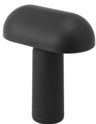
Porta Table Lamp Black H 23,5 x W 20,2 x D 11,2 x Ø 6,5 cm