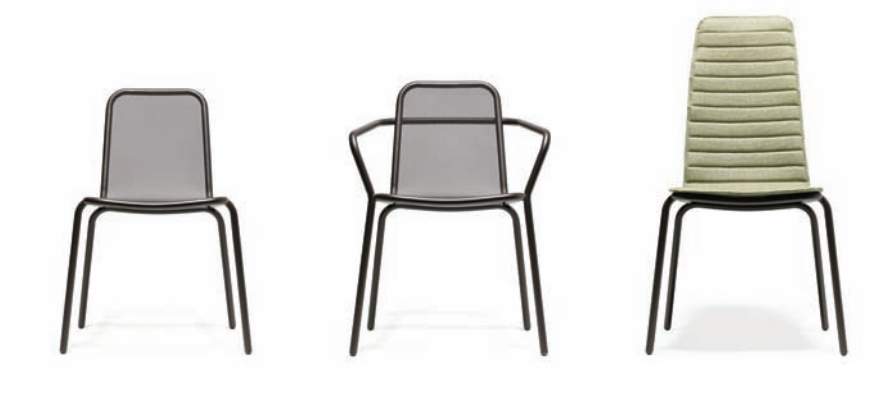
STARLING CHAIR [ 57 x 60 x 78 cm ]