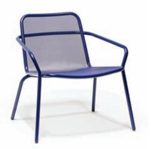
STARLING LOW ARMCHAIR [ 67 x 69 x 69 cm ]