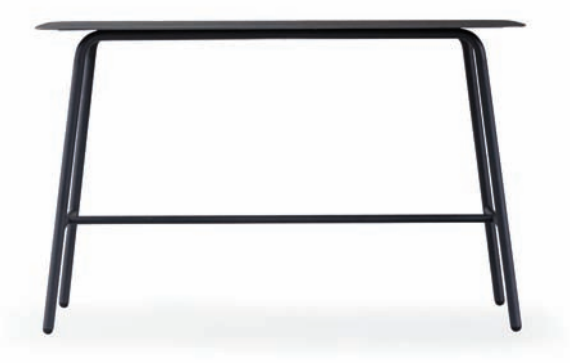
STARLING BAR TABLE CERAMIC/HPL TABLE TOP [ 90 x 90 x 110 cm ] [ 180 x 70 x 110 cm ]