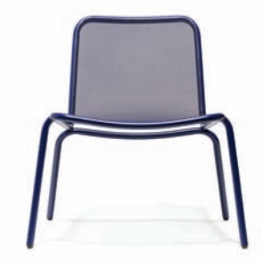
STARLING LOW CHAIR [ 67 x 69 x 69 cm ]