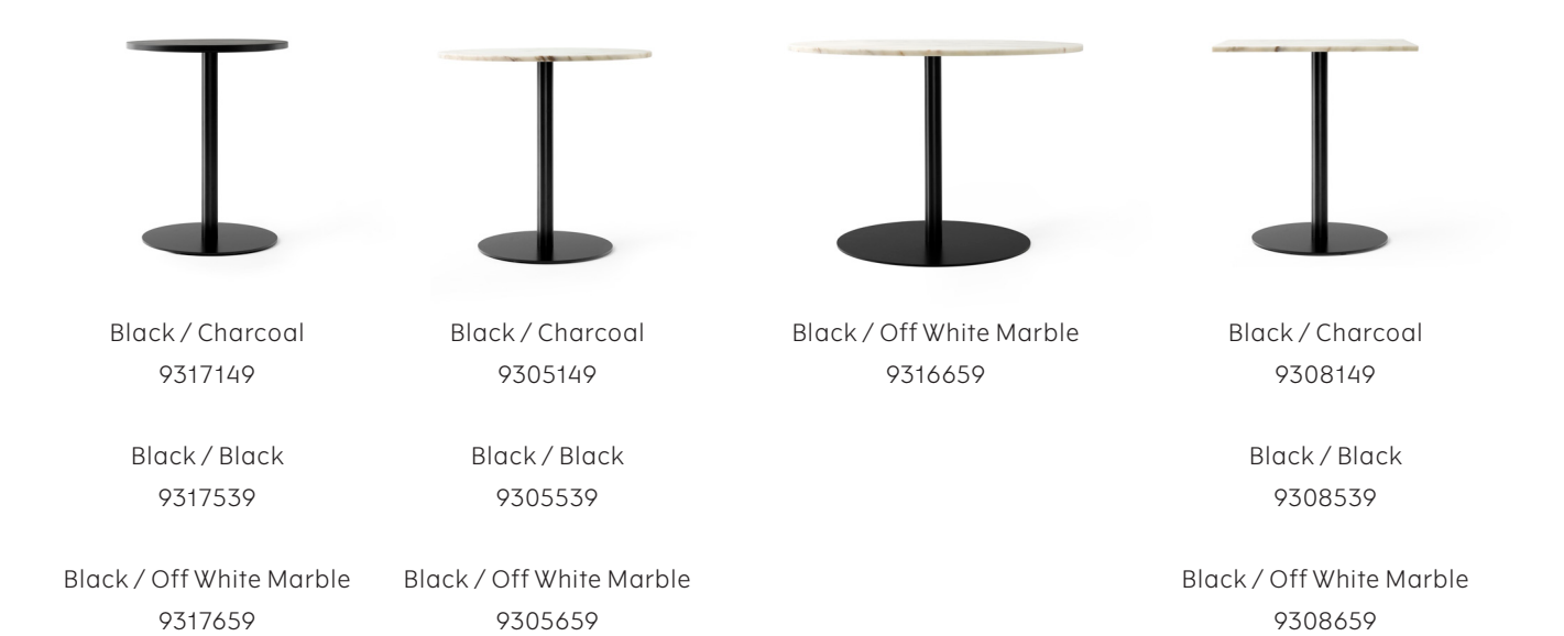
Table Top Options