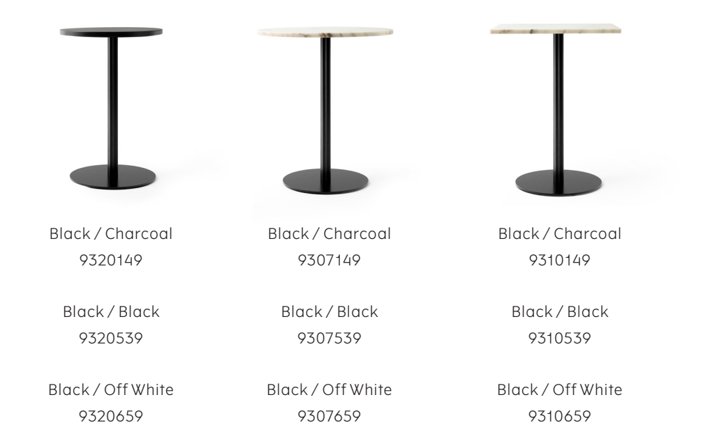
Table Top Options