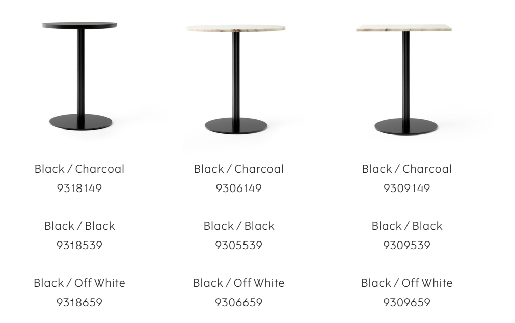
Table Top Options