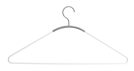
White/Stainless Steel 9001639