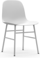
Form Chair Steel, Chrome, Brass