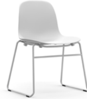
Form Chair Stacking