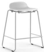
Form Barstool 65 cm Stacking