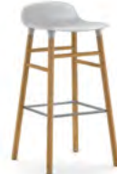
Form Barstool 75 cm Wood