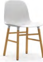
Form Chair Wood