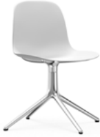
Form Chair Swivel 4 Leg