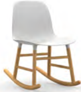
Form Chair Rocking