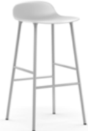
Form Barstool 75 cm Steel, Chrome, Brass