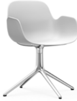
Form Armchair Swivel 4 Leg