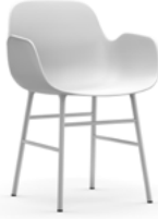
Form Armchair Steel, Chrome, Brass