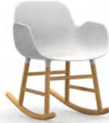
Form Armchair Rocking