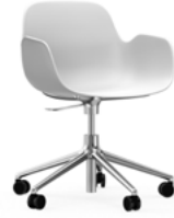
Form Armchair Swivel 5 Wheel Gaslift