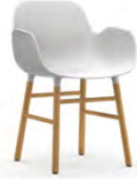
Form Armchair Wood