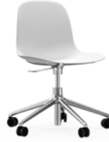
Form Chair Swivel 5 Wheel Gaslift